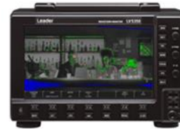
Leader CINEZONE with integrated exposure tools for ARRI (on left) and RED (on right) camera users