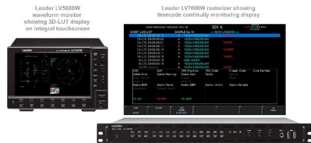
LV5600W and LV7600W both incorporate WebRTC (Web Real-Time Communication) interfaces allowing secure remote control and monitoring from a web-connected desktop or laptop computer.